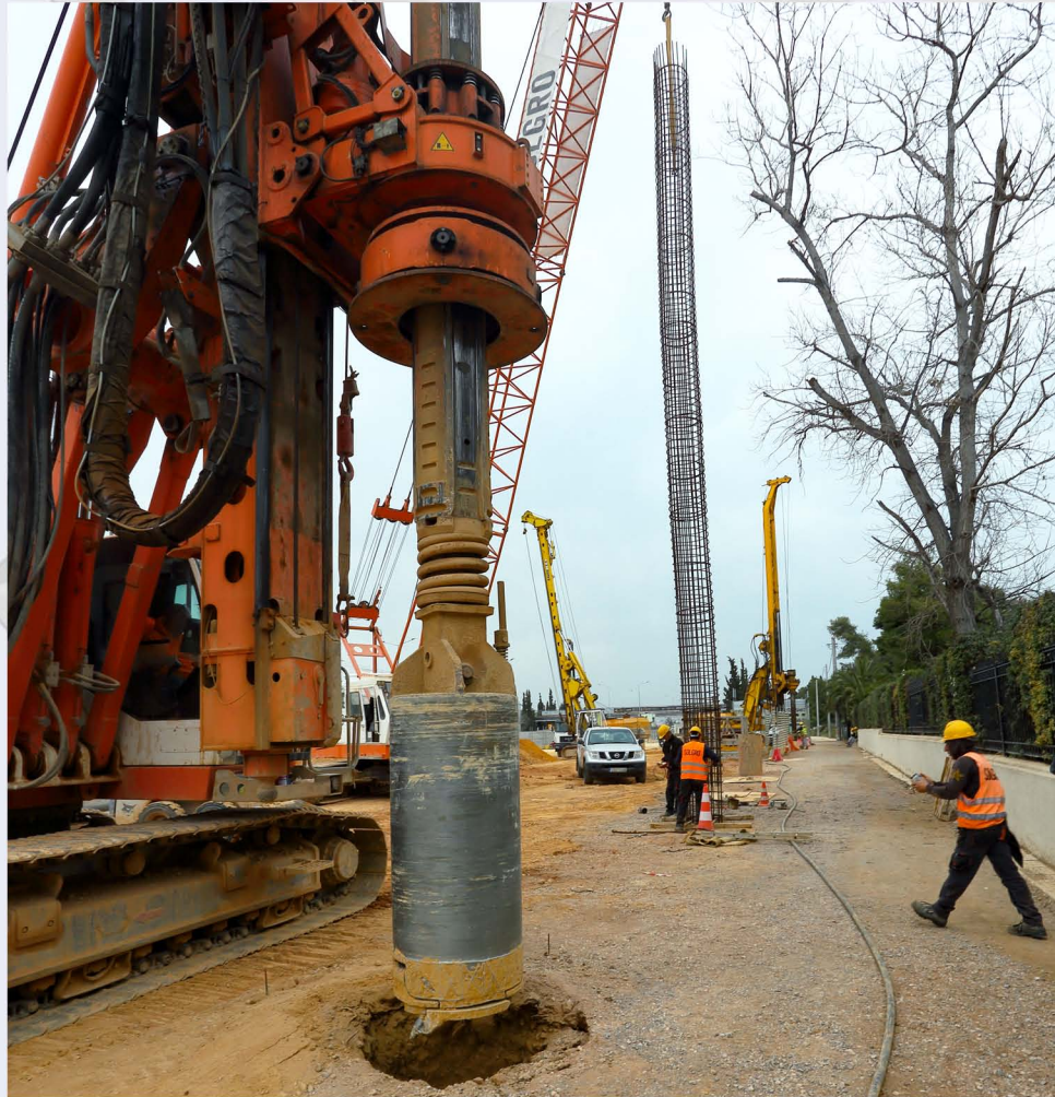
Pile drilling in Veikou TBM Shaft.