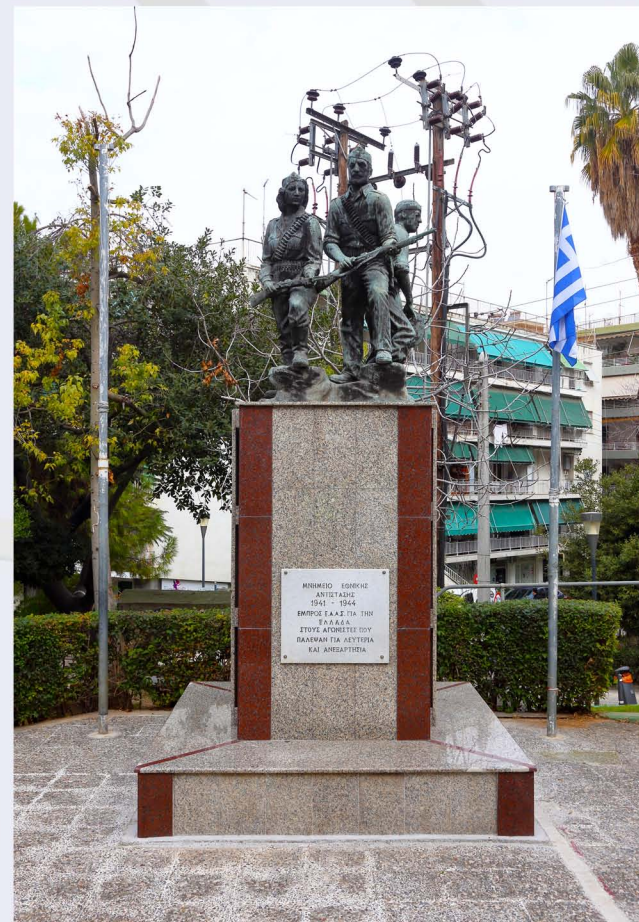
Relocation of the National Resistance Monument at Pigis square (Municipality of Galatsi).

The following works of art have been successfully transferred by specialized work groups on the basis of suggestions made by Galatsi and Athens Municipal Authorities: National Resistance Monument, "Kyveli" monument, "Epinikio" sculpture; these works of art have been placed at the following new locations. The National Resistance Monument was placed at Galatsi square, "Kyveli" monument was placed at in the area of Academy of Athens, and "Epinikio" sculpture was placed at Kolonaki square.