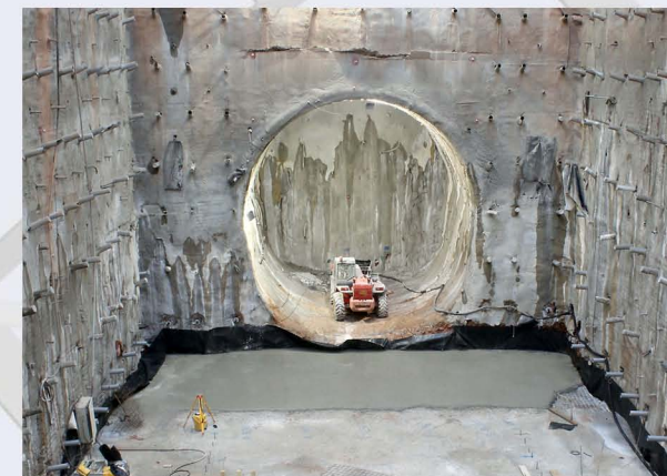
Conventional excavation tunnel for TBM launching.