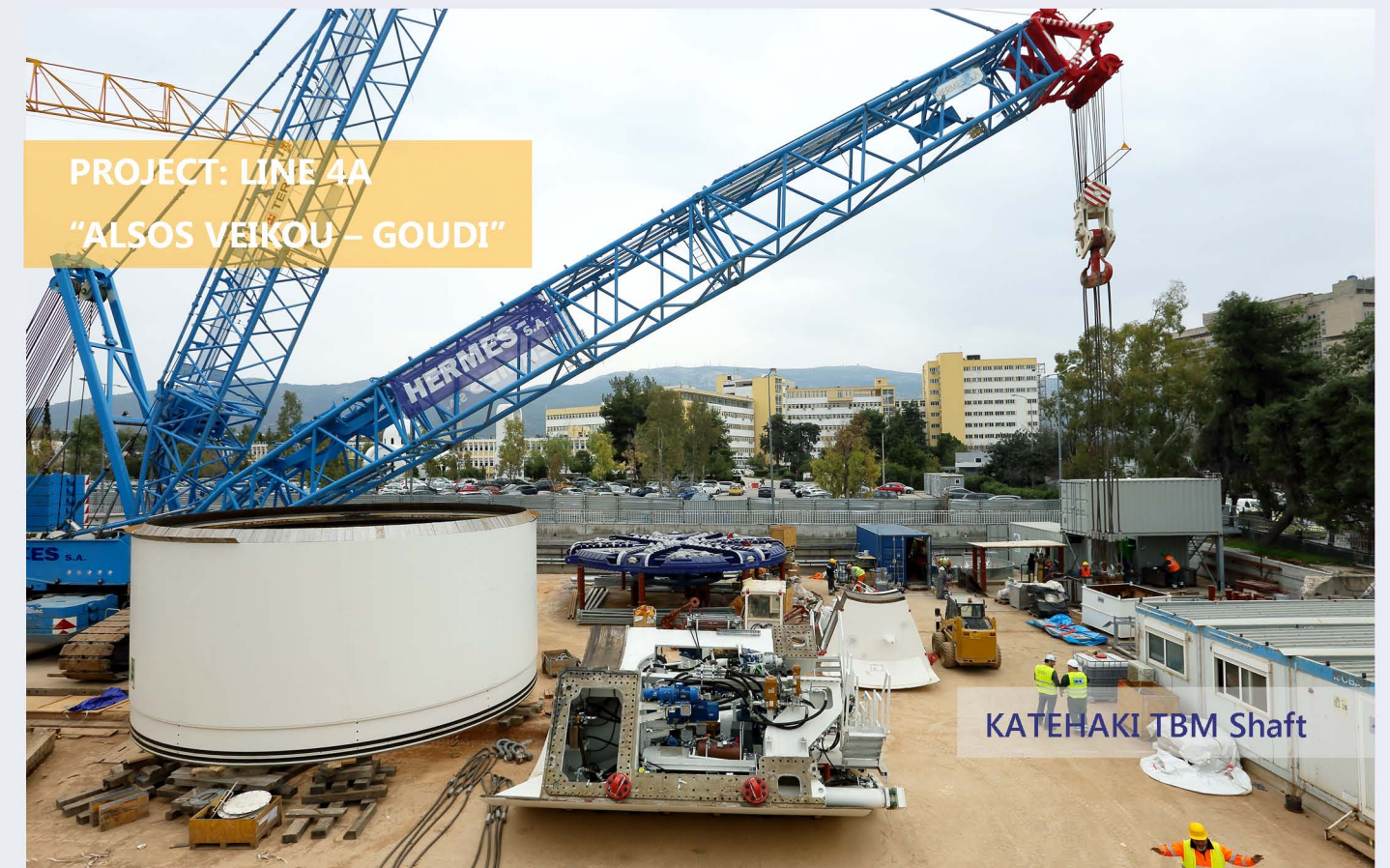
PROJECT: LINE 4A "ALSOS VEIKOU – GOUDI"