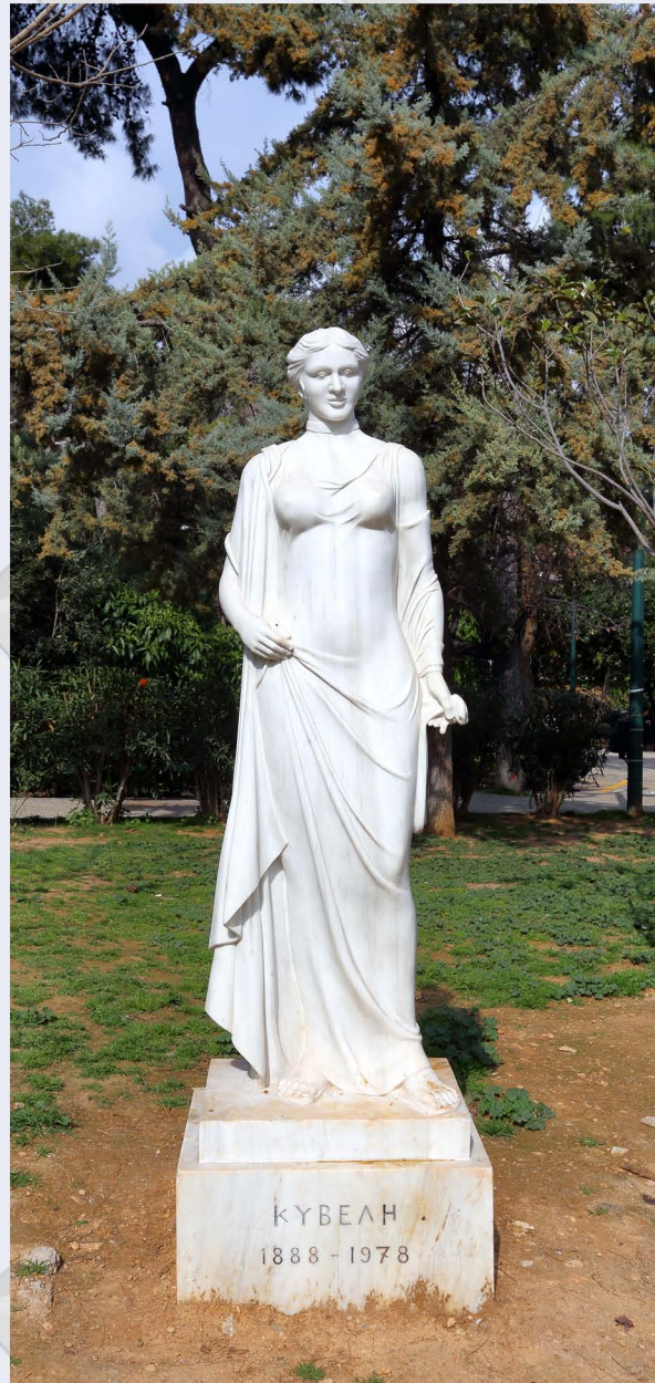
New place for "Kyveli" monument at Egyptou square (Municipality of Athens).

The following works of art have been successfully transferred by specialized work groups on the basis of suggestions made by Galatsi and Athens Municipal Authorities: National Resistance Monument, "Kyveli" monument, "Epinikio" sculpture; these works of art have been placed at the following new locations. The National Resistance Monument was placed at Galatsi square, "Kyveli" monument was placed at in the area of Academy of Athens, and "Epinikio" sculpture was placed at Kolonaki square.