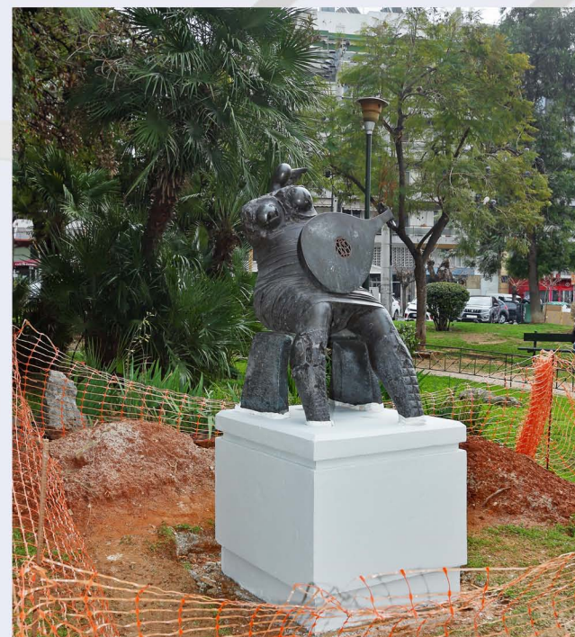
"Epinikio" sculpture was placed at Vrazilias square (Municipality of Athens).