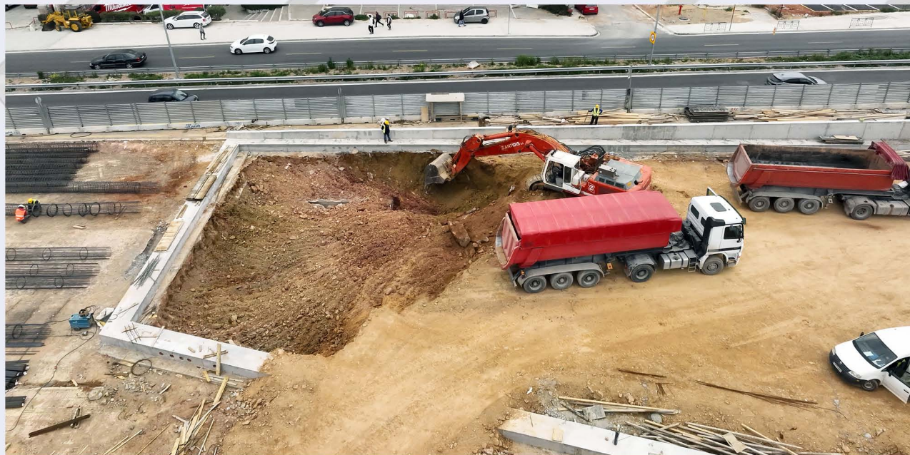
Pile drilling in Veikou TBM Shaft.

Furthermore, the excavation of the 1st level of the trench at the south side (approximately 3m underneath the natural soil) is in progress and worksite installation related works are being carried out.