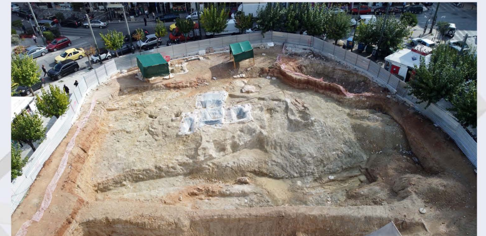
Archaeological sections in KYPSELI Station.