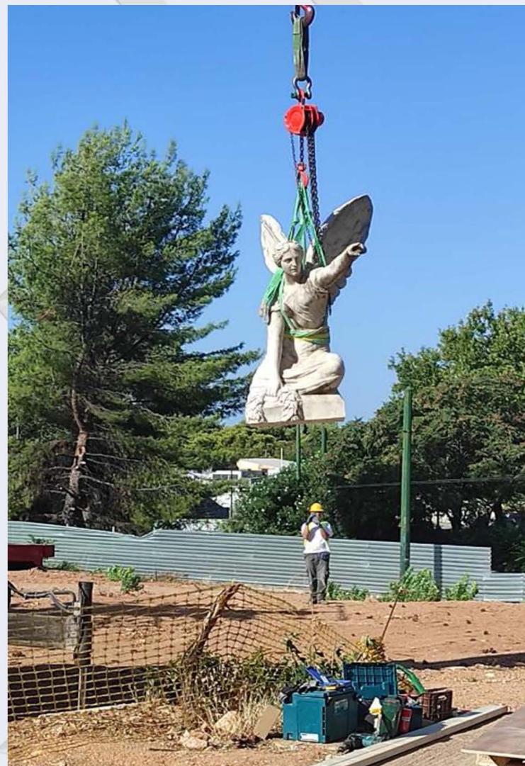
Removal of the monument dedicated to the memory of the Reserve Officers from DIKASTIRIA Station.