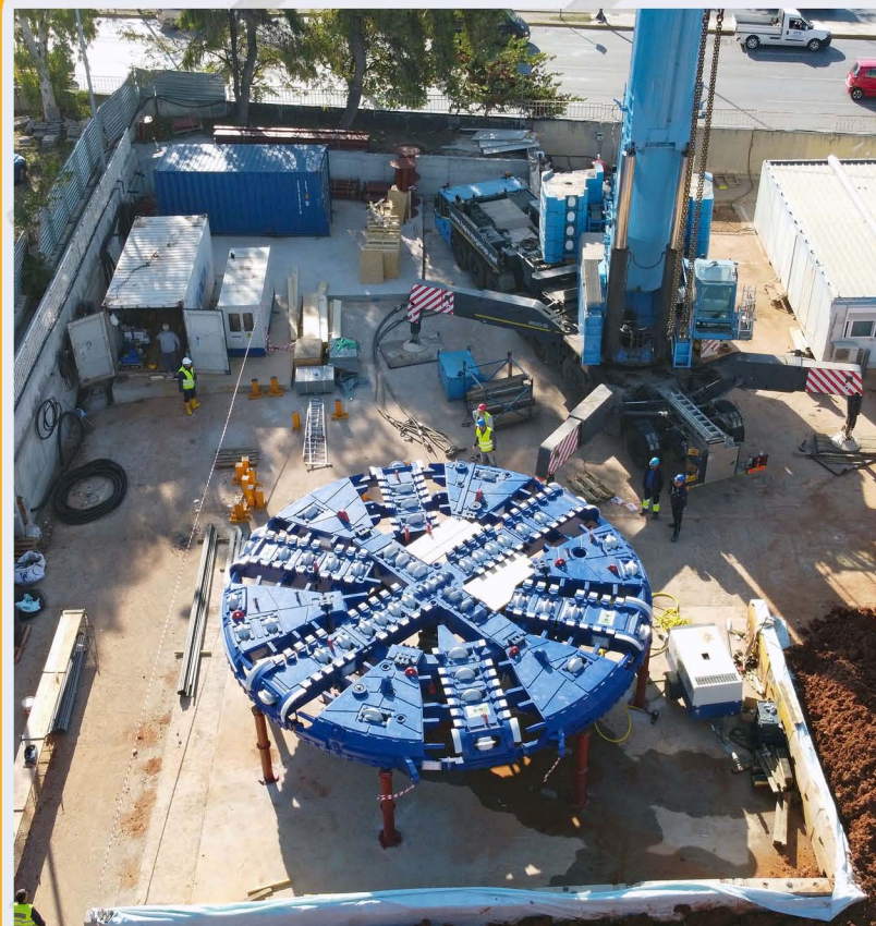
Arrival of the TBM cutter head in TBM Katehaki Shaft.

The first state-of-the-art TBM arrived in Athens in October. This TBM will start from Katehaki Shaft, while the transportation of its equipment and its assembly are already in progress on site. At the same time, the excavation of the 10th level of the shaft continues with the total excavation percentage having reached 65%. In parallel, the construction of the anchors (boring – installation – grouting) at the 10th row of this level continues, while a shed was immediately constructed to protect the cutter head.