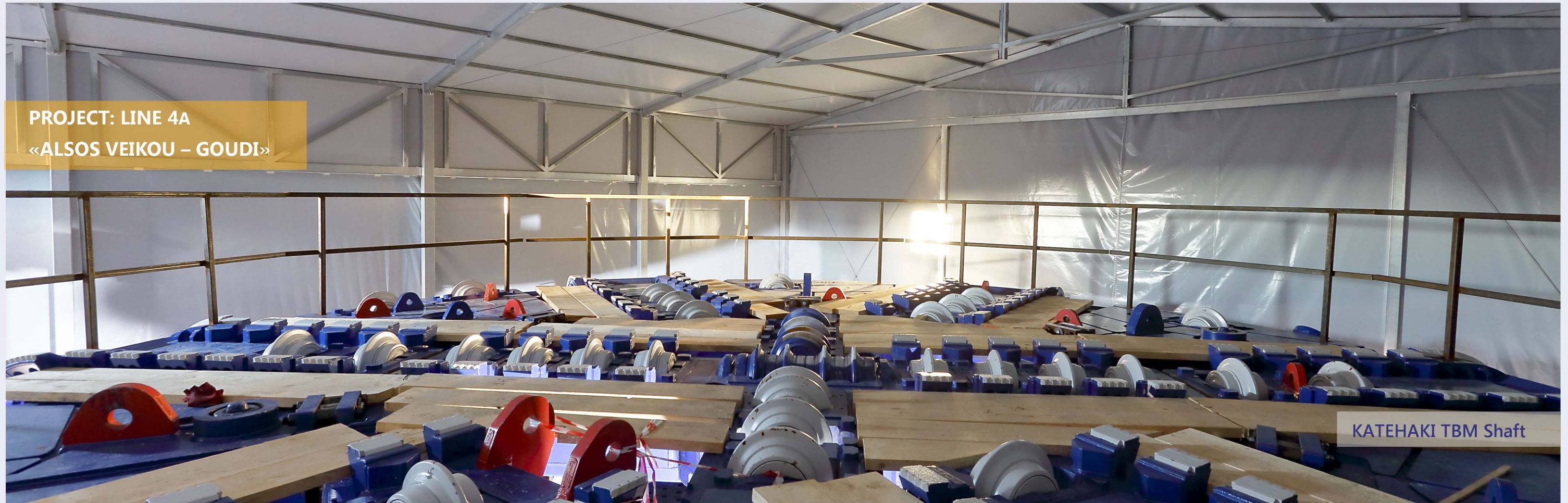
KATEHAKI TBM Shaft