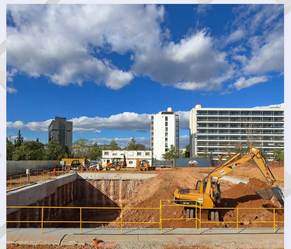
Excavation of the 1st level in GNA Shaft.

In GNA Shaft, the construction of the piles of the shaft is complete and currently excavation works are carried out at the 1st level using hydraulic hammer.