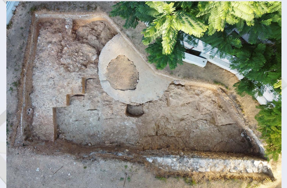
Archaeological sections in KESSARIANI Station.

Excavation of investigation trenches in the framework of the archaeological works continues in ELIKONOS, KYPSELI, EXARCHIA, AKADIMIA, ILISSIA, ZOGRAFOU, KESSARIANI Stations and in Vivliothiki Shaft. Finally, in GOUDI Station, archaeological works have been suspended for safety reasons due to the significant depth of the encountered superficial layer.