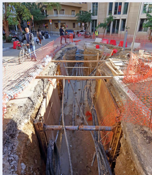
PUO networks relocation works in KOLONAKI Station.

In AKADIMIA Station, works for the diversion of the natural gas network have commenced adjacent to the Cultural Centre of the Municipality of Athens.