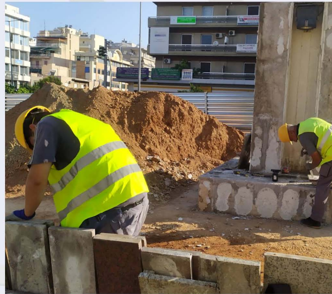
Works for the removal of the National Resistance Monument from GALATSI Station.

In the framework of the preliminary works contract, the removal, transportation, cleaning, maintenance and temporary storage of statues, busts and works of art located in the worksites continues. Recently, specialized work crews transported the works of art from DIKASTIRIA, GALATSI and EXARCHIA Stations worksites to ensure the unhindered continuation of the works. In particular, the National Resistance Monument was removed from GALATSI Station and was successfully relocated to Pigis Square.