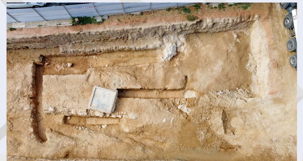
Archaeological sections in ELIKONOS Station.