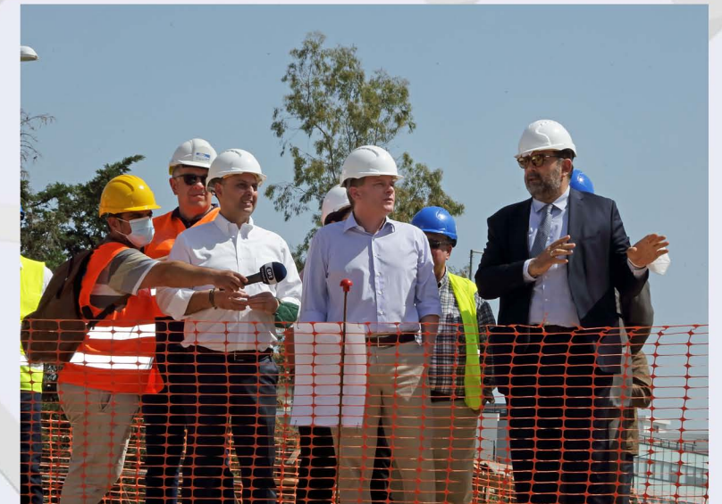
Briefing of the Minister of Infrastructures & Transport by the Managing Director and Vice-President of ATTIKO METRO S.A.