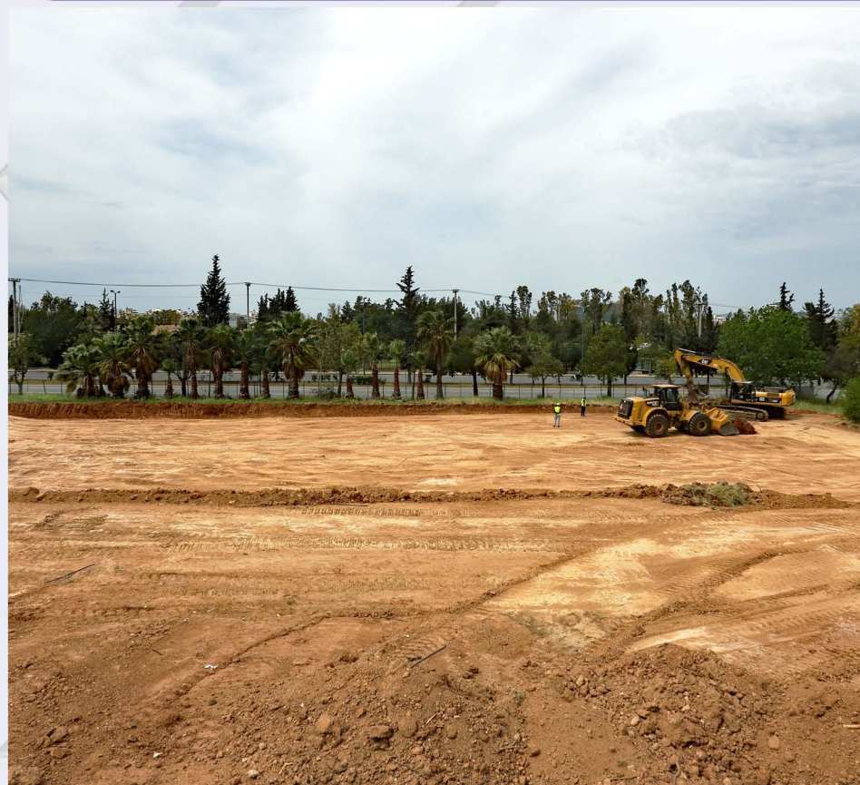
Soil grading for accommodating the central worksite offices of the Contracting Joint Venture.

For the installation of the central worksite offices and facilities of the Contracting Joint Venture responsible for the construction of Line 4A, grading works have commenced in Kanellopoulou Street next to GNA Hospital (Hellenic Airforce General Hospital).