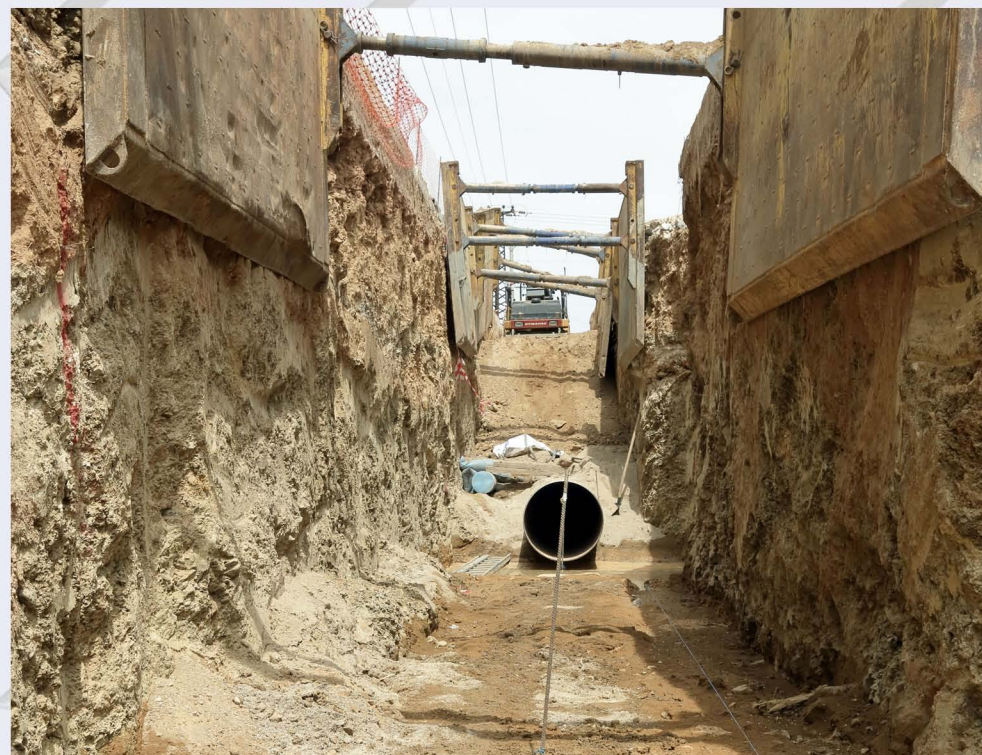
Diversion of water supply duct in Veikou TBM Shaft.

In Veikou TBM Shaft, works for the relocation of PUO networks continue, the most significant ones being a) the diversion of the Ø900 dual water supply duct of EYDAP (ATHENS WATER SUPPLY AND SEWERAGE COMPANY) and b) the diversion of the 19 bar natural gas steel network.