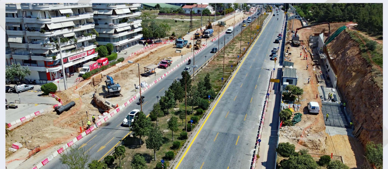
Traffic modifications in Veikou Avenue.

Stage B of the traffic modifications at Veikou TBM Shaft area have been implemented through the installation of new traffic signs along Veikou Avenue.