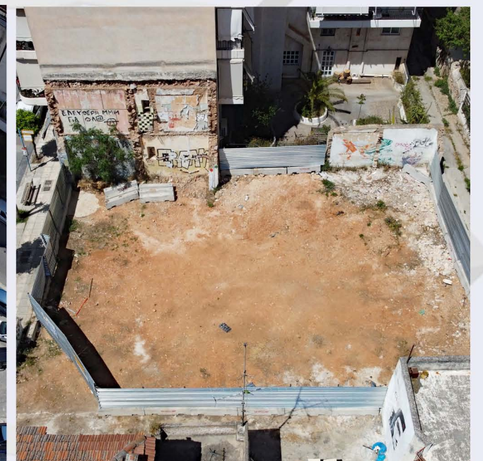
Worksite fencing – Near East Shaft.