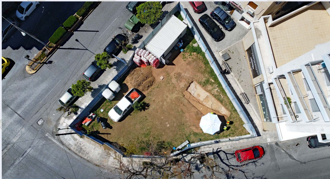
Archaeological trench in KAISARIANI Station.