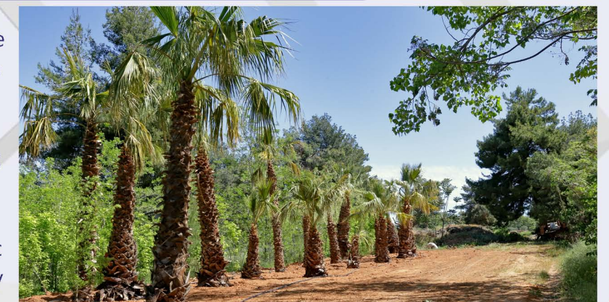
Transplanted palm trees – Tree nursery of the Municipality of Athens.

Tree relocation works continue in the Municipalities of Athens and Galatsi. Moreover, in the plant nursery of the Municipality of Athens the last palm trees were relocated, so that the shaft-related works next to GNA Hospital (Hellenic Airforce General Hospital) may commence.