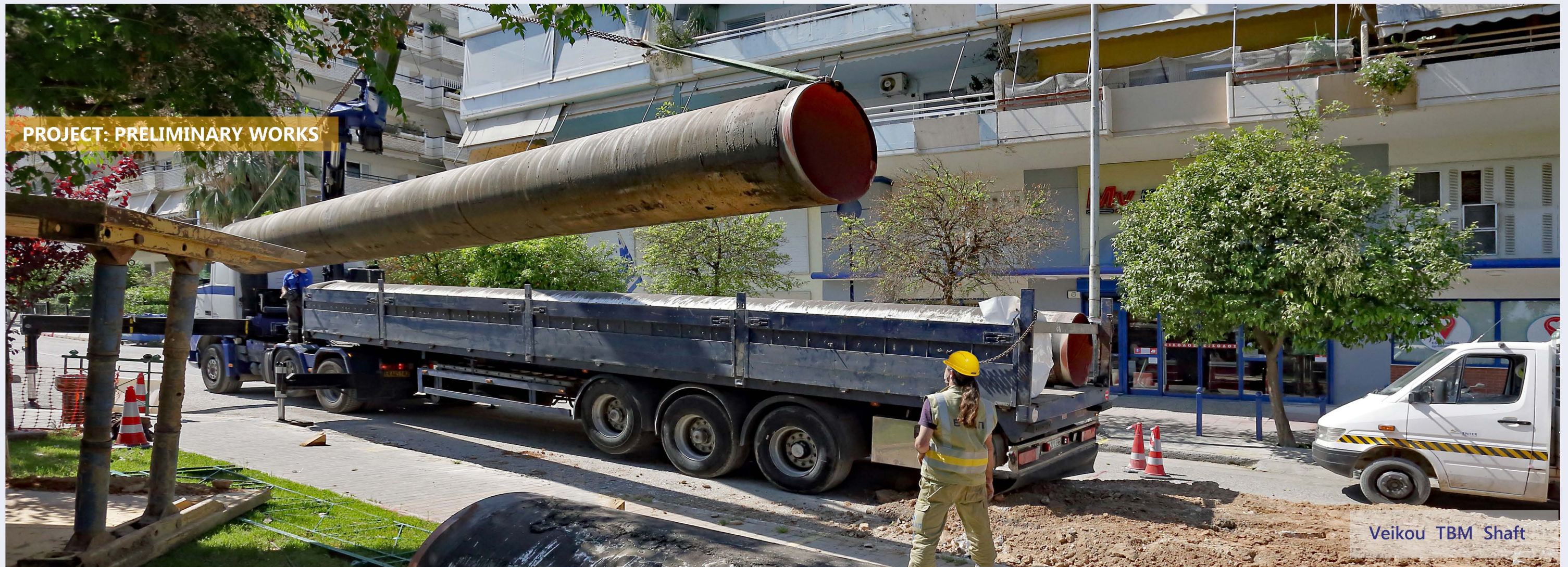
Veikou TBM Shaft