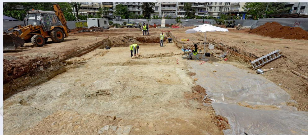
Archaeological works in KYPSELI Station.