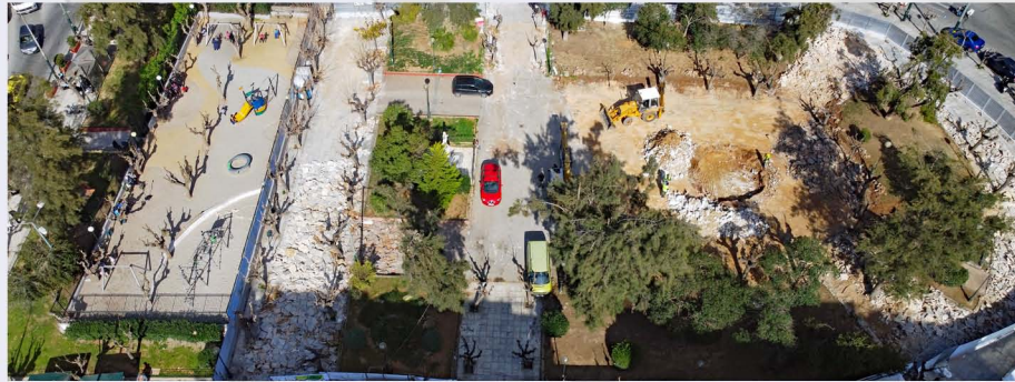
Worksite fencing for the construction of KYPSELI Station.