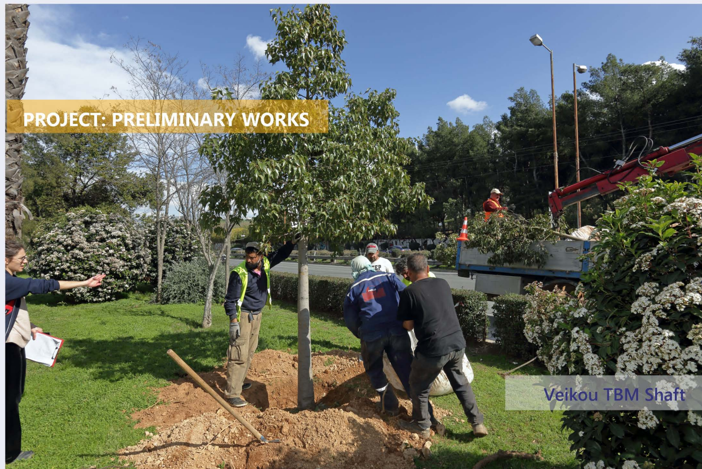
Veikou TBM Shaft