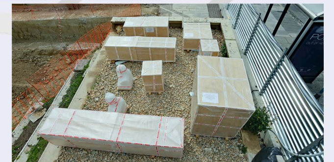
Archaeological works in KOLONAKI Station.

In AKADIMIA Station the works for the removal of pieces of marble architectural fragments from the worksite area in the green area at the north of the building of the former Cultural Center of the Municipality of Athens.