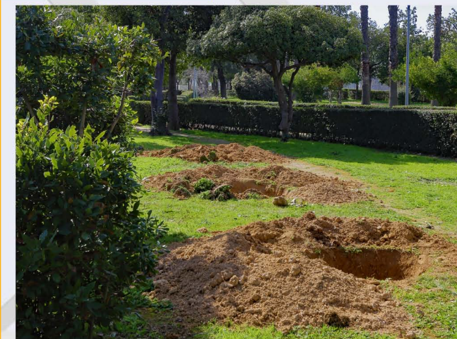
Soil preparation for the acceptance of trees.