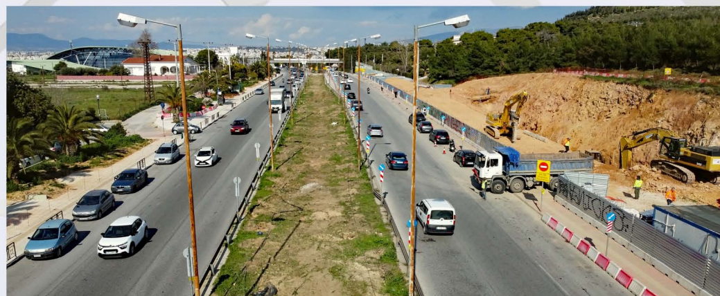
Traffic regulations on Veikou Avenue.

Signage posts have been installed for the implementation of traffic regulation Phase A' in Veikou Shaft. Excavation works have also commenced for the foundation of a parapet wall to retain the slope of Alsos Veikou and for the diversion of Ø900 twin water supply ducts of EYDAP Water Supply Company.