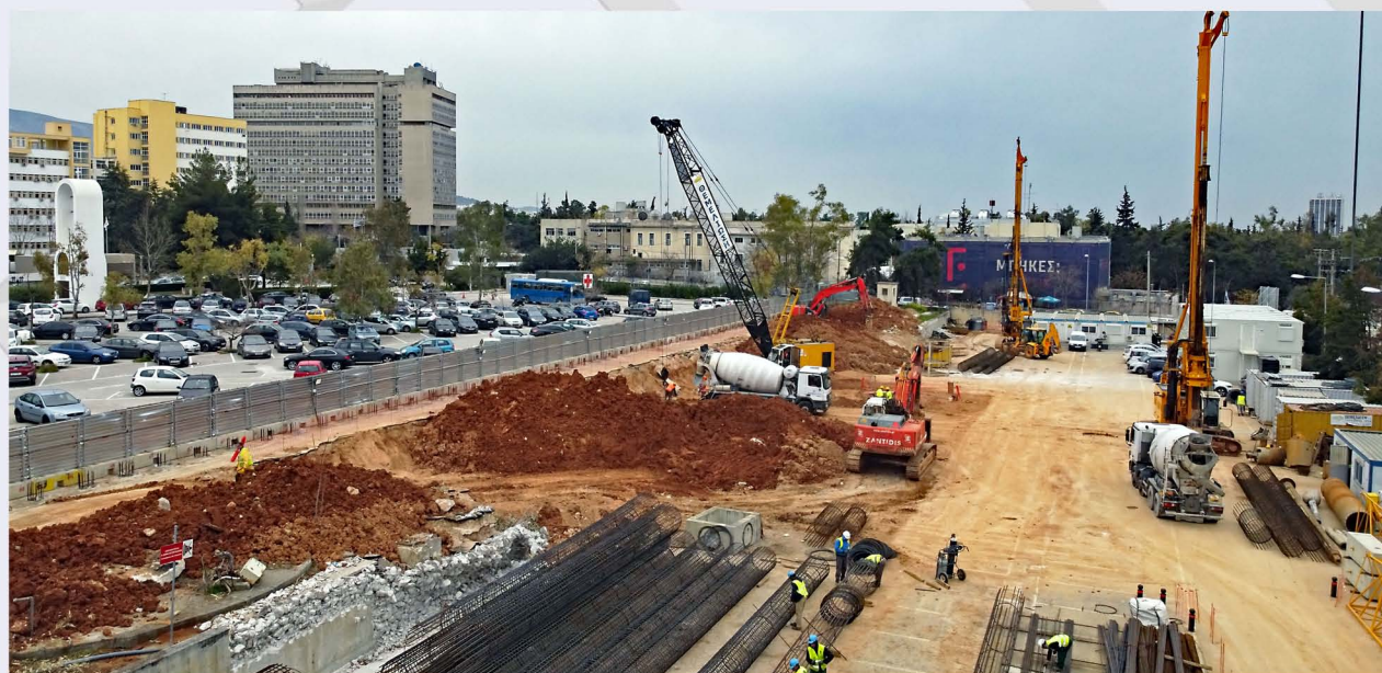
TBM Katehaki Shaft.

On 07/02/2022 the European Investment Bank and ΑΤΤΙΚΟ ΜΕΤΡΟ S.A. concluded a new record EUR 580 million Financing Agreement intended for the construction of the Athens Metro New Line 4A.