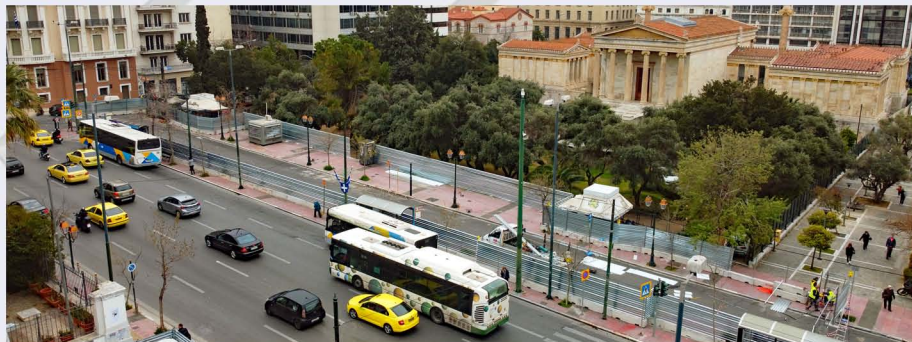
Worksite fencing on K. Palama Street (AKADIMIA Station).

Worksite fencing was installed at the new worksite intended for the construction of KAISARIANI and KYPSELI Stations.