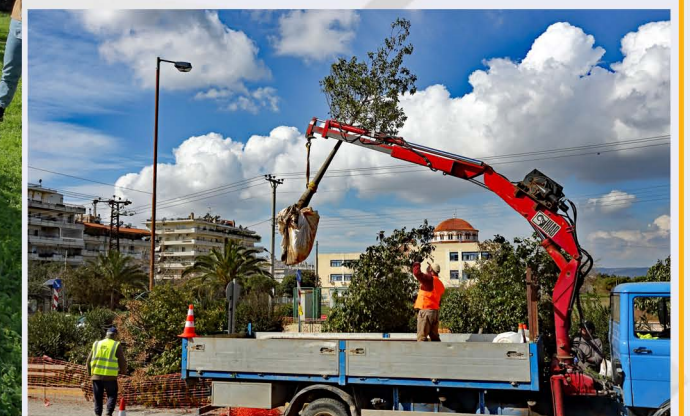
Transplanting works – Galatsi Municipality.

At the same time, transplanting works are being continued in the Municipality of Athens, while they will commence in the other municipalities where Line 4A stations will be located, thus, improving the environmental conditions and the life of citizens.