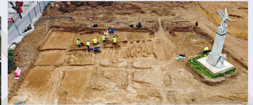
Archaeological works in DIKASTIRIA Station.