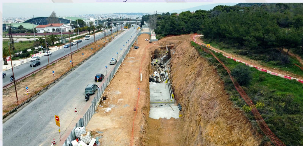
Excavation for the diversion of Ø900 twin water supply ducts of EYDAP Water Supply Company.