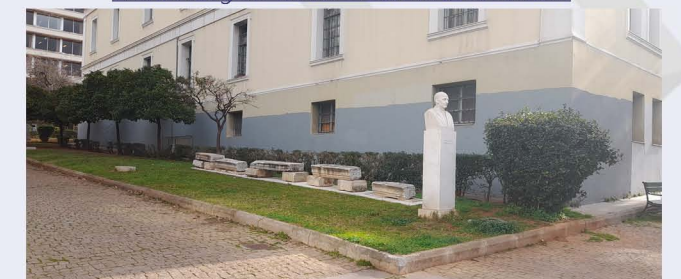
AKADIMIA Station – Installation of pieces of marble architectural fragments.