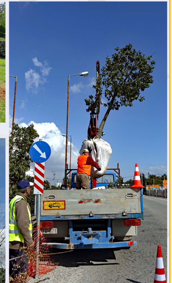
Veikou Avenue – Transplanting works.