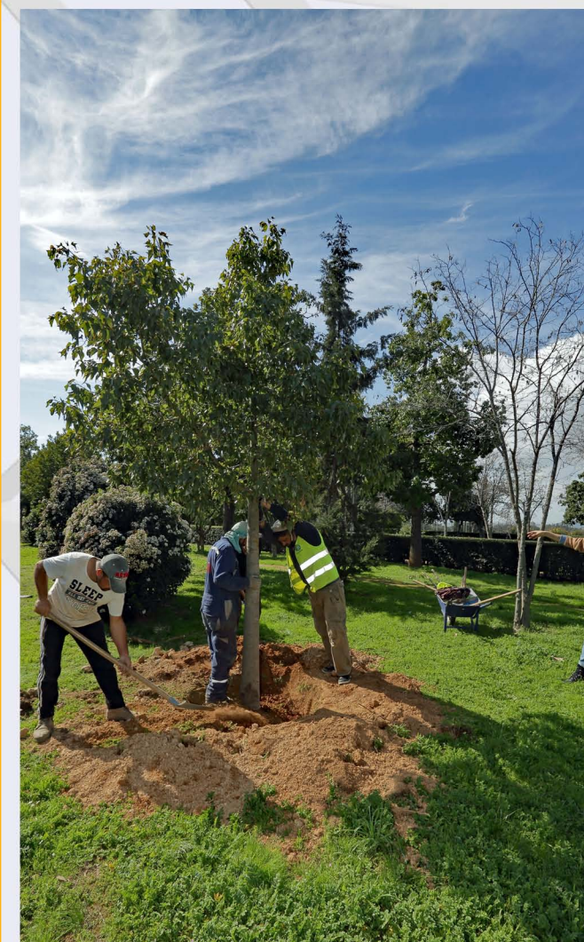
Veikou Avenue – Transplanting.