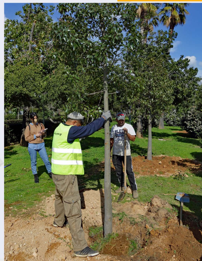
Transplanting works in the municipality of Galatsi.

More precisely, in the area of ALSOS VEIKOU Station, acacias, jacarantas, locust-trees, sour orange trees, plane trees, plum trees, golden rain trees, pomegranate trees and mulberry trees will be transplanted at the adjacent flower beds as well as in Belogianni and Apostolou Santa Squares. In the area of GALATSI Station, the trees will be transplanted in the near-by sidewalks and flower beds. As concerns ELIKONOS Station, trees will be transplanted in the municipal flower beds, in Galatsi Olympic Center – PALAI and in Alsos Veikou.