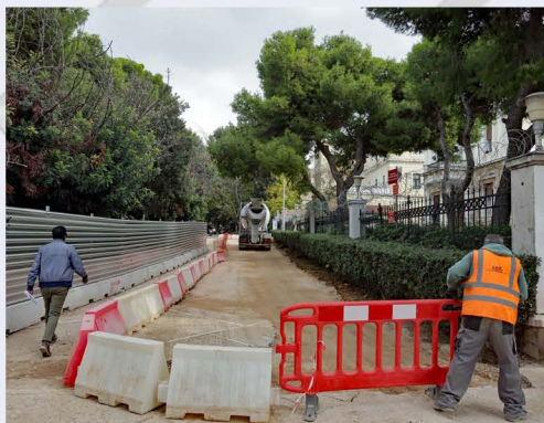
Construction of a ring road section on the north side of Hellenic National Defense College.