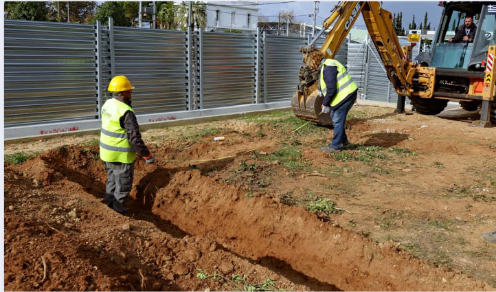
Archaeological trial pits at Veikou TBM Shaft.