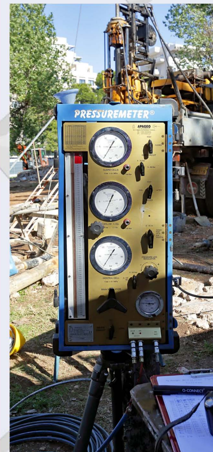
Pressuremeter test - measuring & readout unit.

During borehole drilling activities, a number of tests are being conducted both at laboratories and in situ, which are utilized for the determination of the geotechnical design parameters of the Project.