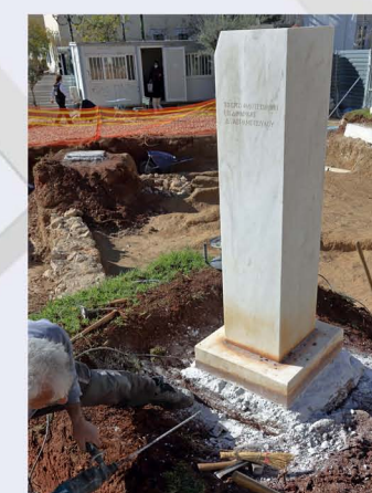
Grigorios Xenopoulos bust base in Akademia.