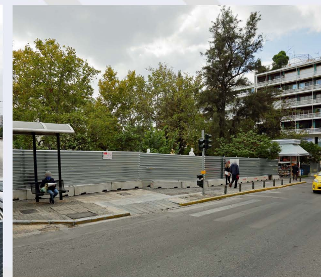
Worksite fencing at "Kolonaki" Station.

Worksite fencing has been installed at the new worksites at Alexandras Avenue and in Kolonaki square, while fencing has been extended at Veikou Avenue, in view of the commencement of preliminary works at "Alexandras" Station, "Kolonaki" Station and at Veikou TBM shaft, respectively.