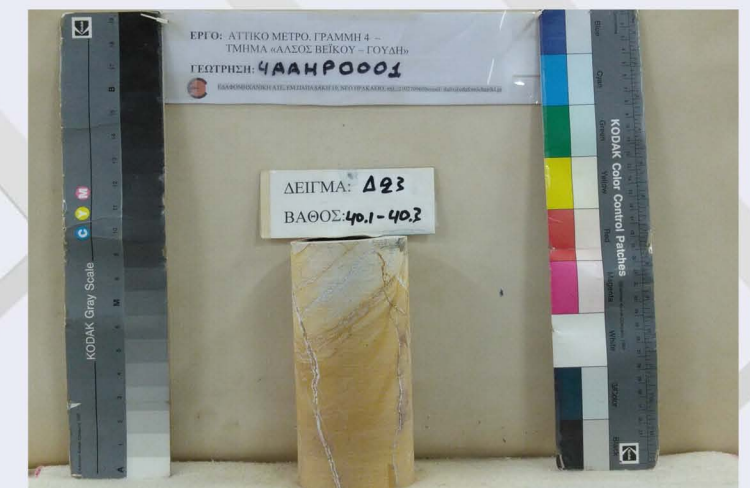
Specimen prior to the performance of unconfined compressive strength test.