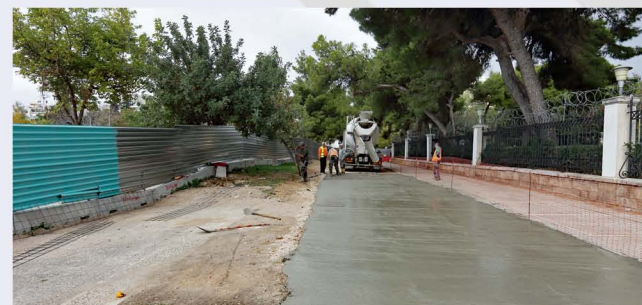
Configuration of the Hellenic National Defense College ring road.

A new outer ring road at the north and west side of the Hellenic National Defense College towards Protomayias Square is being constructed to provide safe circulation of both vehicles and residents participating in the celebrating events organized by the delete College.