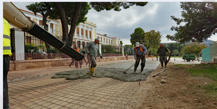
Cement road paving works towards Protomayias Square.