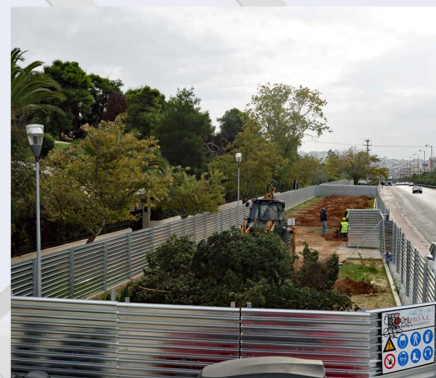
Worksite fencing at Veikou Shaft.