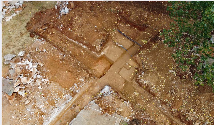
Archaeological trial pits at "Dikastiria" Station.

The archaeological works at Katehaki TBM shaft have been completed while they are undergoing at the worksites of "Kolonaki" Station, "Dikastiria" Station, "Akademia" Station and at Veikou shaft. The works are performed under the supervision of the respective local Department of Antiquities, aiming at the investigating, safeguarding and revealing the archaeological finds.