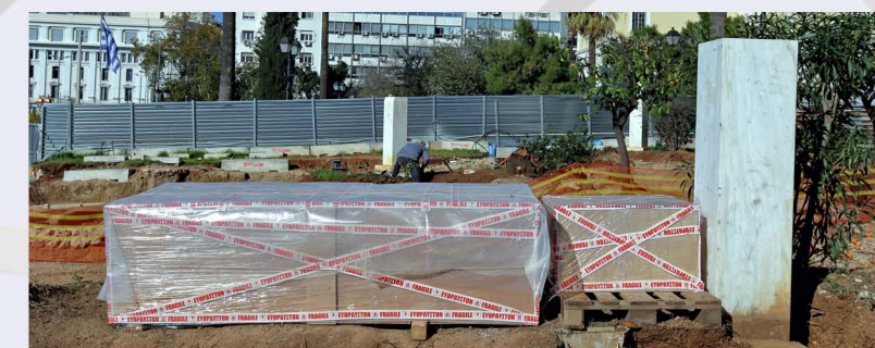
Kyveli marble effigy, packed for transportation.

The first removal of the statue of the famous actress Kyveli from "Akademia" Station was successfully performed with the assistance of a crane and under the supervision of the Cultural Heritage Department of the Municipality of Athens and executives of ATTIKO METRO S.A..